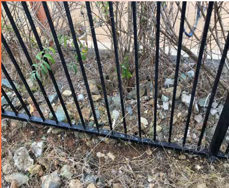
INCOMPLETE FENCE PREP (NON COMPLIANCE)